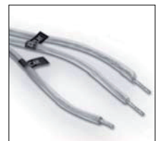
Assembly option : car and display