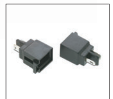
ISO connector (woofer)