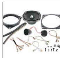
Accessories (connectors and spacers)