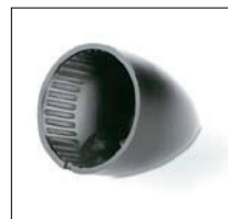
Tilted mounting Easy installation