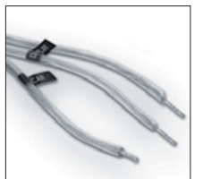
Assembly option : car and display