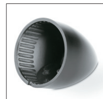
Tilted mounting Easy installation