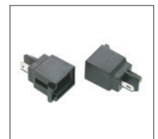
ISO connector (woofer)