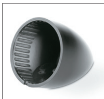
Tilted mounting Easy installation