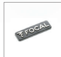
Focal logo (aluminium -diamond cutting)