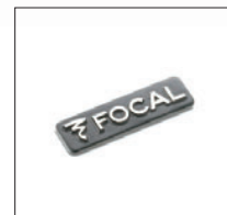
Focal logo (aluminium -diamond cutting)