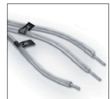
Assembly option : car and display