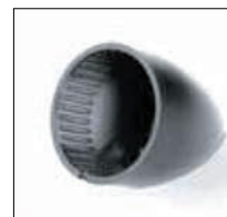
Tilted mounting Easy installation