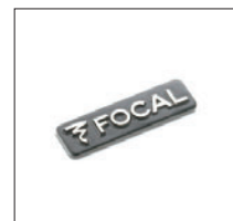
Focal logo (aluminium -diamond cutting)