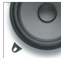
Removables ABS clips (2/3/4 holes fixing points)